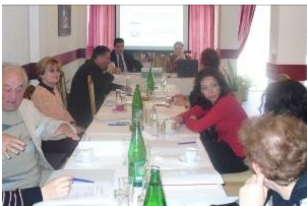
RELLMAS training, Skopje 12 December 2008

The project started in January 2008 and it is expected to end in October 2009.